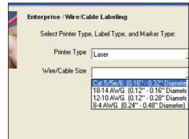
Select Details of Application