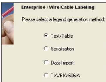
Select Method of Data Input