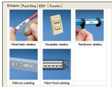
Select Labeling Application