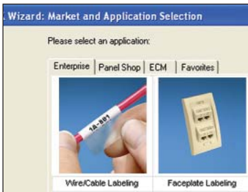
Select Specific Market