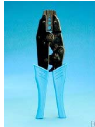
Crimping Tool Frame Only