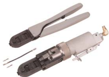
Micro Pneumatic Power System with Straight Action Hand Tool