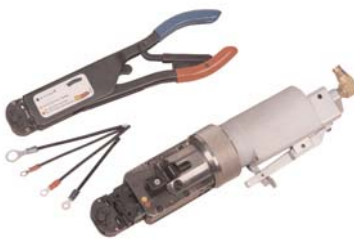
Micro Pneumatic Power System with T-HEAD Hand Tool