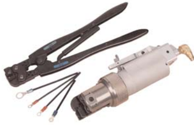
Micro Pneumatic Power System with Double Action Hand Tool