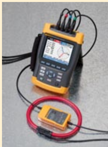
i3000s Flex connected to a Fluke 434 Power Quality Analyzer (The i430 FLEX-4PK can be used with the Fluke 434 and 435, without the need for the control box).

Note: Power supply units only available for Europe and the United Kingdom.