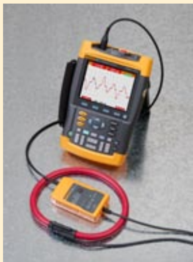
i3000s Flex connected to a Fluke 199C ScopeMeter.

Fluke. Keeping your world up and running.™