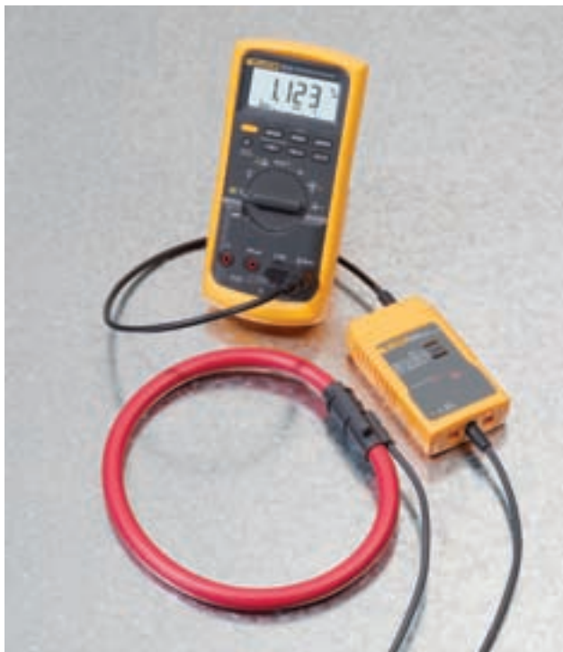
i2000 Flex connected to a Fluke 87V Digital Multimeter.

Ordering information i2000 Flex AC Current Clamp