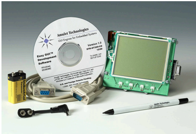
STK-GT320 — Starter Kit with 3.8" LED backlit display and 9V battery STK-GT570 — Starter Kit with 5.7" CCFL backlit display and AC power adapter