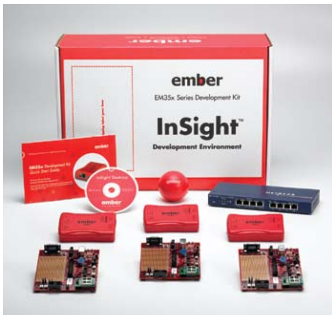
EM35x Development Kit

"...It is as close to 'plug-and-play' as anything I have seen in the industrial world..."