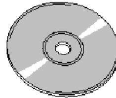
Driver CD ROM