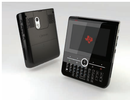
ZOOM OMAP34x-II MOBILE DEVELOPMENT PLATFORM

At the heart of the Zoom OMAP34x-II MDP is Texas Instruments' OMAP3430 applications processor that combines powerful multimedia, graphics, and imaging capabilities with a high-