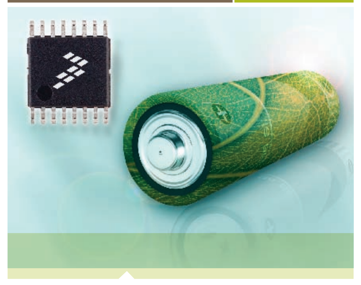
Ultra-Low-Power 8-bit Microcontroller