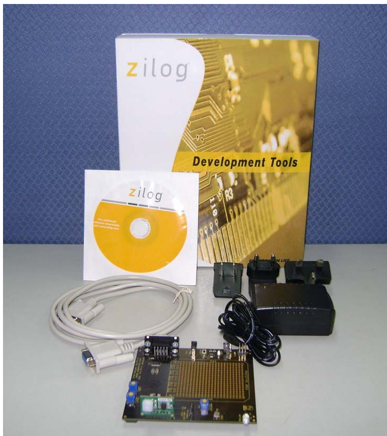
Figure 1. ZMOTION Detection Module Evaluation Kit Components