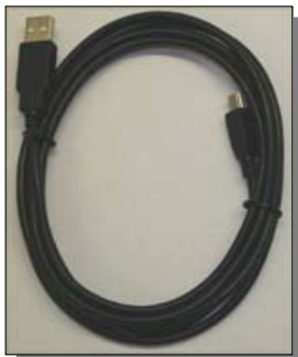
USB Cable (6ft/2m)