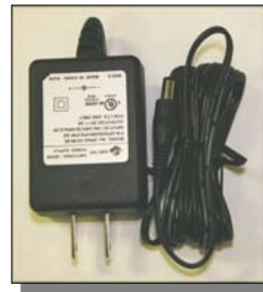
5V-2A Power Supply