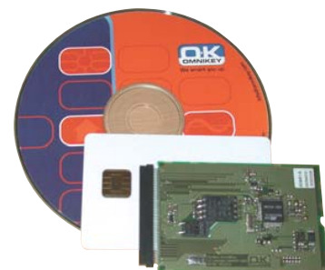
AT83C25OK Reference Design