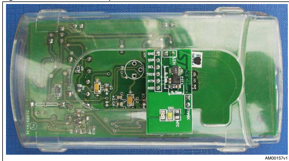
Figure 1. STEVAL-TLL005V1 power flash demonstration board

The STEVAL-TLL005V1 consists of both a motherboard and a daughterboard connected together (STEVAL-TLL004V1 for the daughterboard only).