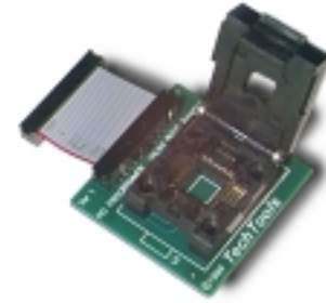
44Pin PLCC Programming Adapter #MP-PLCC44