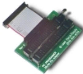
40Pin ZIF Programming Adapter #MP-ZIF40