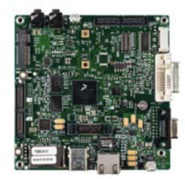
i.MX51 Evaluation Kit