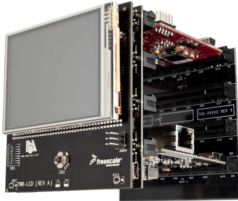
Figure 2 - Tower System with TWR-LCD