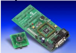
PICDEM™ HPC Explorer Board

Purchase a High Pin Count Explorer Board ( DM183022 ) and J-series Plug-in Module (PIM) from Microchip Direct using coupon code PIC18JPIM to receive the PIM for only $5! Plug-in Modules for each J-series family (MA180011 – MA180020).