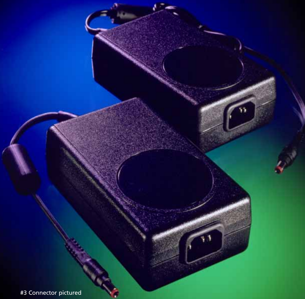
#3 Connector pictured