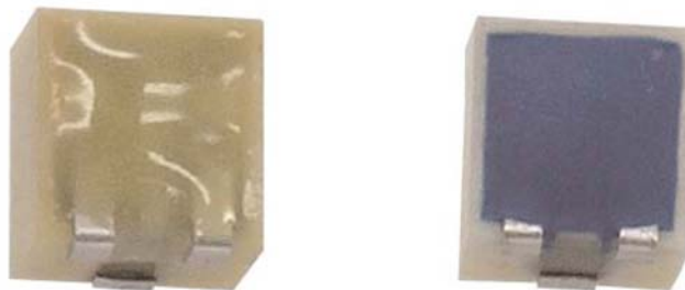
Tan Epoxy Compared to Traditional Blue Epoxy

New samples and test data are available upon request. We will be releasing additional models with the tan epoxy and notice will be made prior to their release.