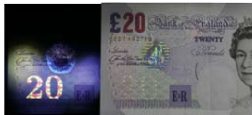
365nm UV-A light