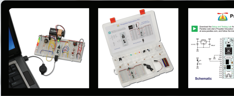
System: Windows 2K/XP/Vista and a USB Port. Copyright © Parallax Inc. 2008.