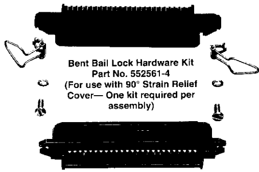
Bent Bail Lock Hardware Kit Part No. 552561-4 (For use with 90° Strain Relief Cover— One kit required per assembly)