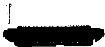
Screw Lock Hardware Kit Part No. 229911-1 (Two required per assembly)

Only fastening hardware supplied, other items shown for reference purposes.