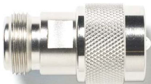
Model 73047 N Type Jack to UHF Plug Adapter