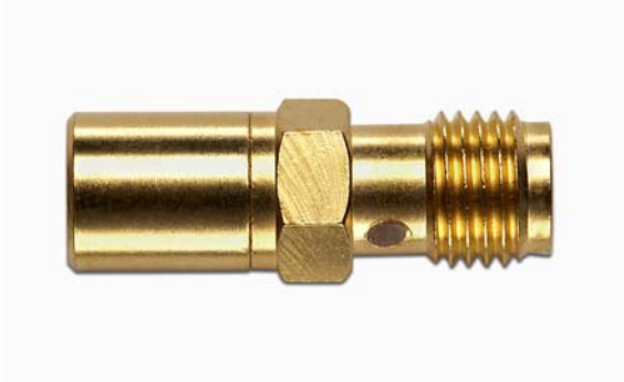
Model 72979 SMA (F) TO SMB (F)