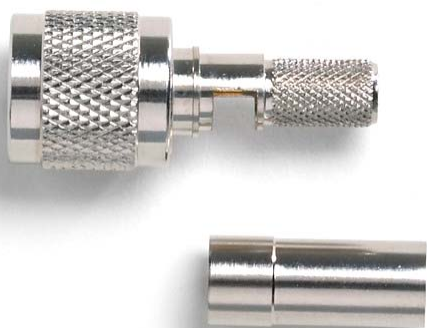
Model 73057 TNC Plug, 50 Ohm, Crimp Type, RG59, 62