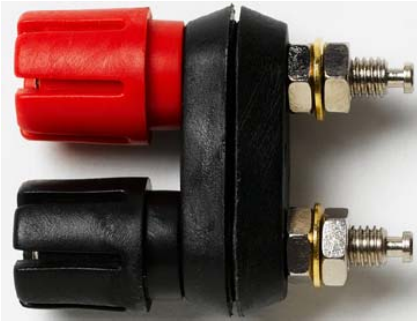
Model 6883 Dual Binding Posts