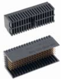
3M™ MetPak™ HSHM Press-Fit Header