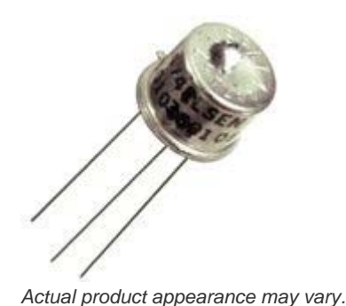
3601 Series TO-5 Thermal Switches