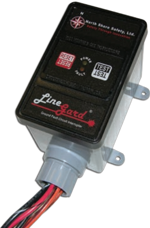
Flying Leads (Splice-in)