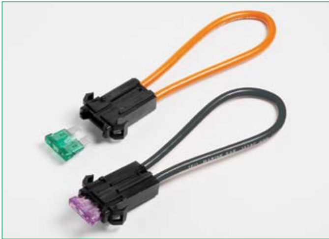
Dimensions in mm / Maße in mm