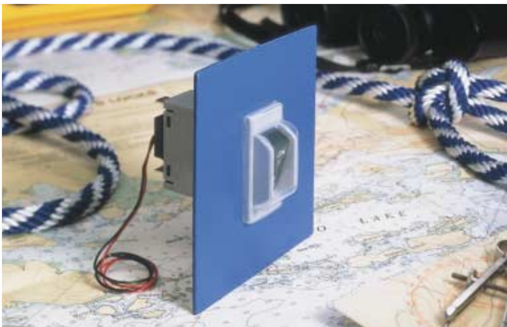
Carlingswitch M Series Rocker Actuator Switch with C1113/71 E-SEEL