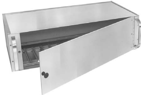
Rack with HFP52-1 Hinged Front Panel (side)